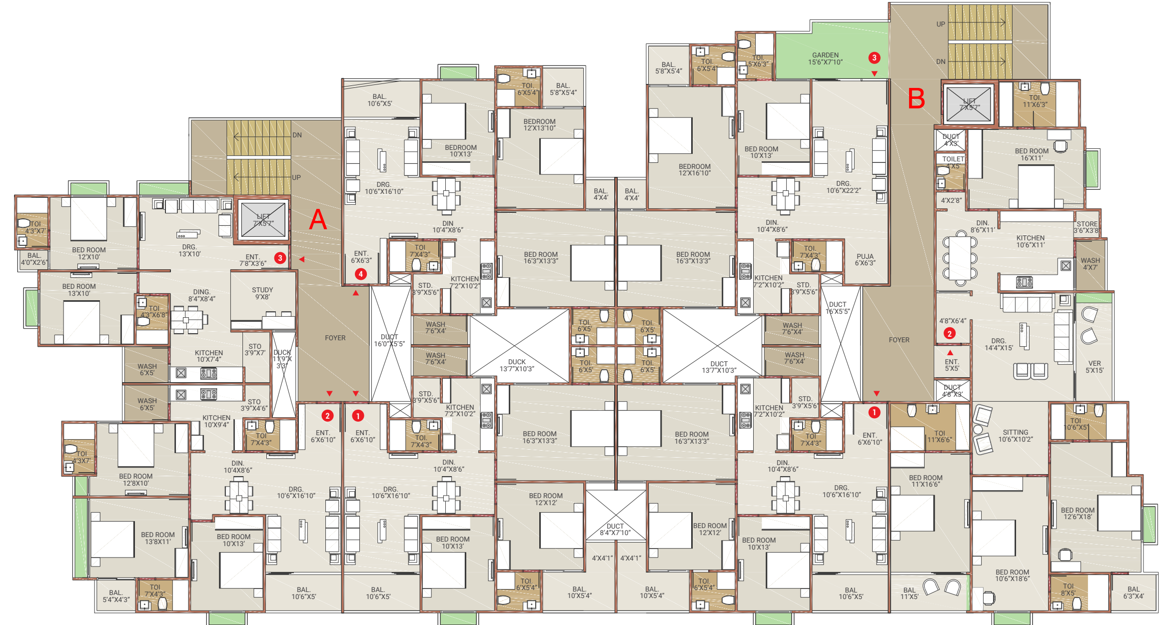
▶ FOURTH TO SEVENTH FLOOR