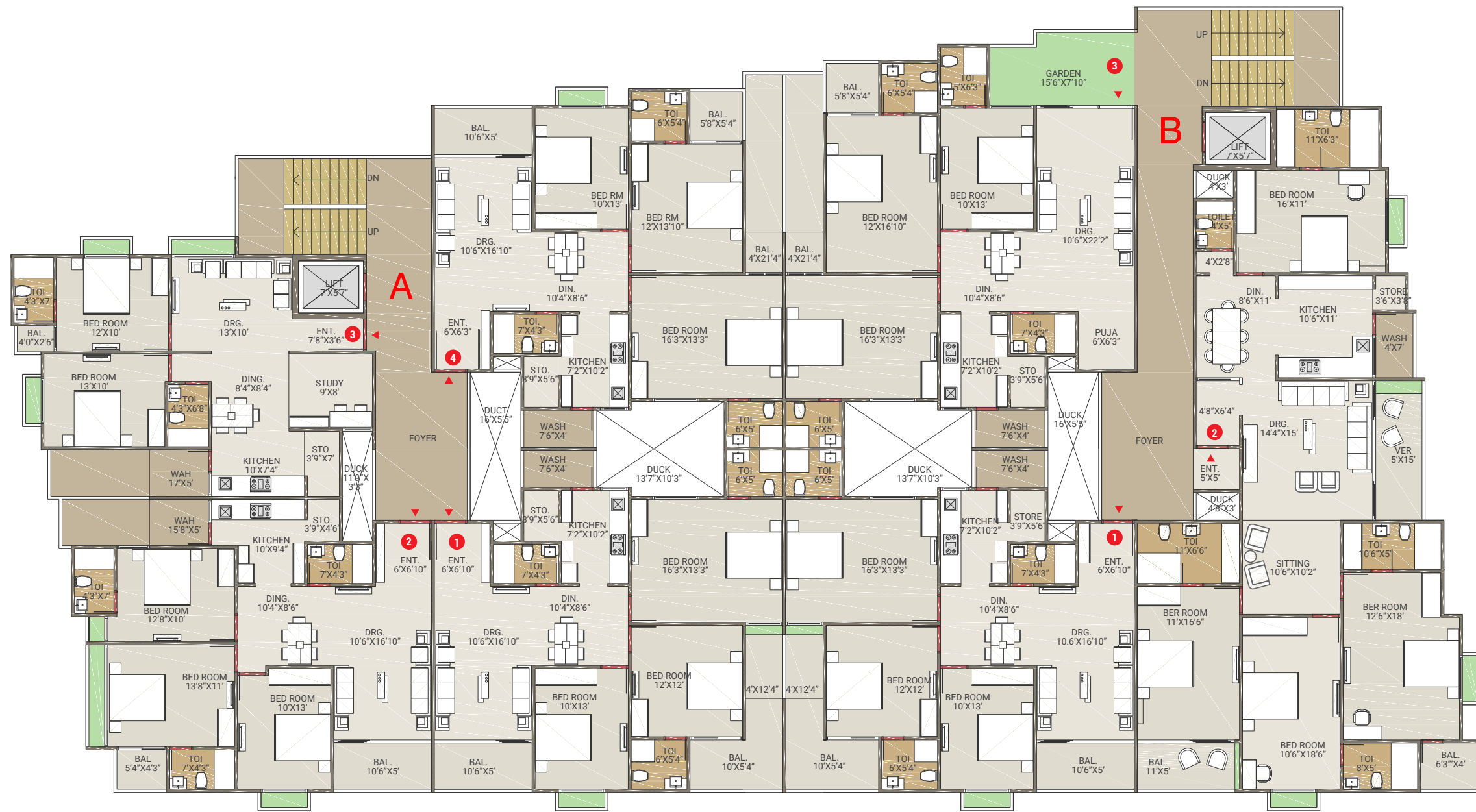
▶ THIRD FLOOR