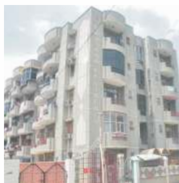
Krishna Residency, Raj Nagar, Ghaziabad (Completed in 2004)