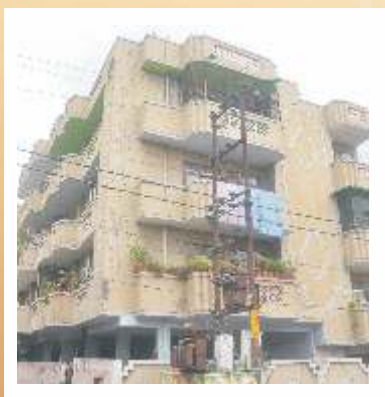
Krishna Kunj, Nehru Nagar-III, Ghaziabad (Completed in 2003)