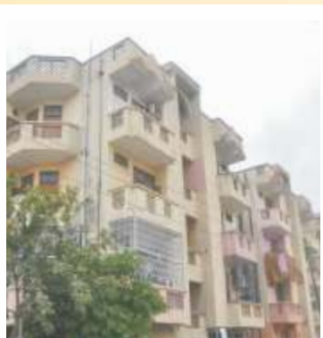
Krishna Vihar, Pratap Vihar, Ghaziabad (Completed in 2005)