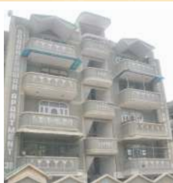
Doodeshwar Apartment, Shalimar Garden, Sahibabad, Ghaziabad (Completed in 2001)