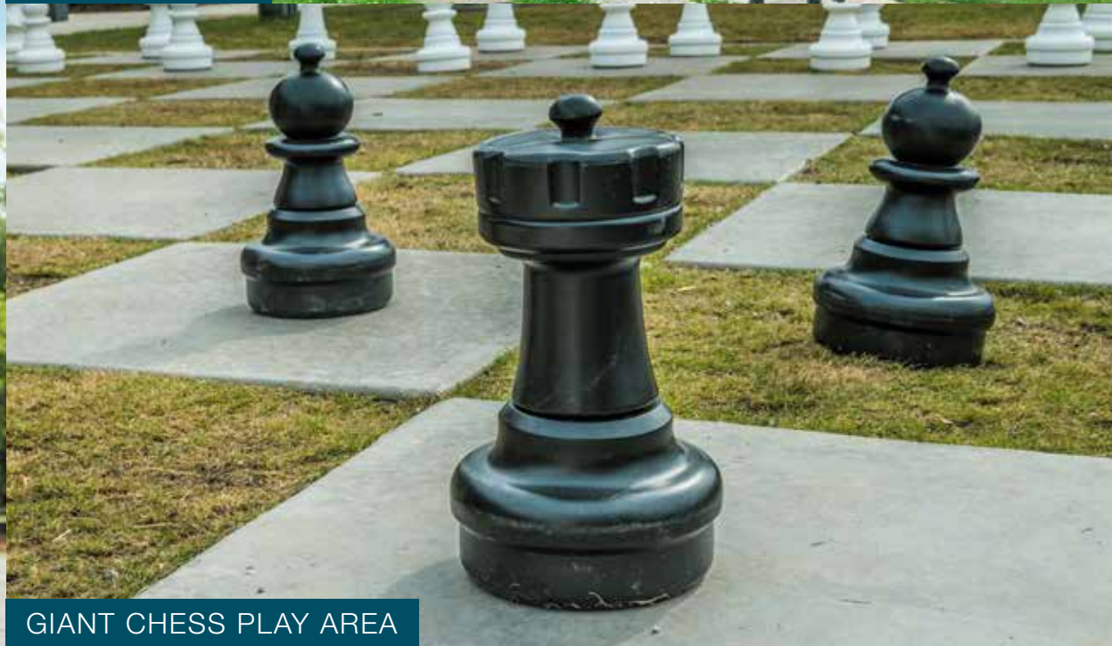
GIANT CHESS PLAY AREA