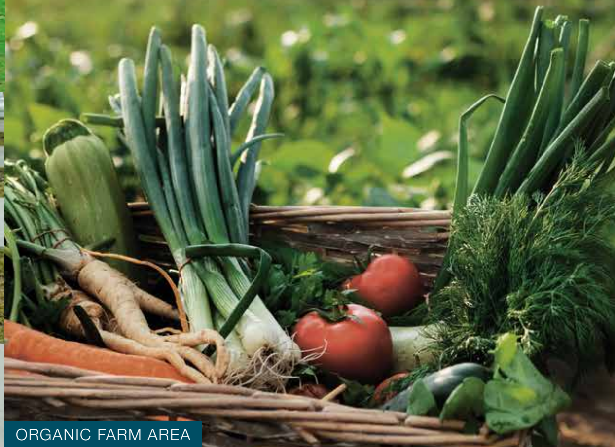
ORGANIC FARM AREA